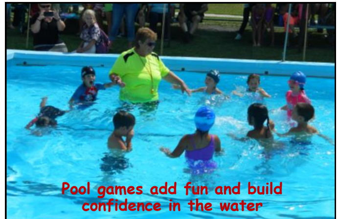
Pool games add fun and build confidence in the water