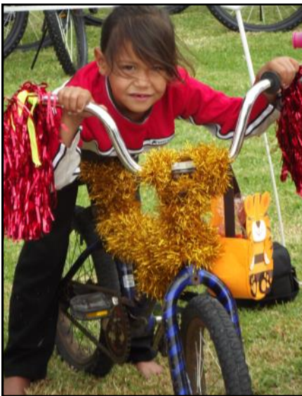
Tukaha dressed-up his bike when we officially opened our bike track.